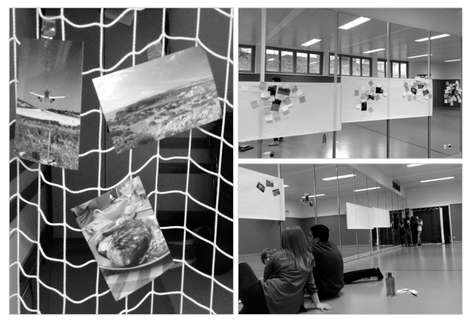
Figure 1: Impressions from the exhibition and the Picture Dialogues

oped in the form of a mind map (figure 2) and was to act as the impulse for the recurring individual photographic practice.