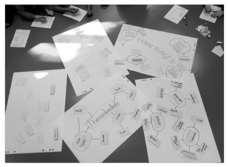
Figure 3: Thematic Map as a result of a two-phased mapping